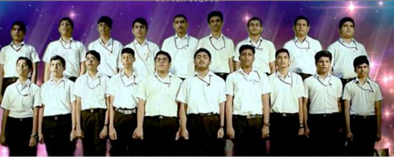
School Anthem (File Photo)