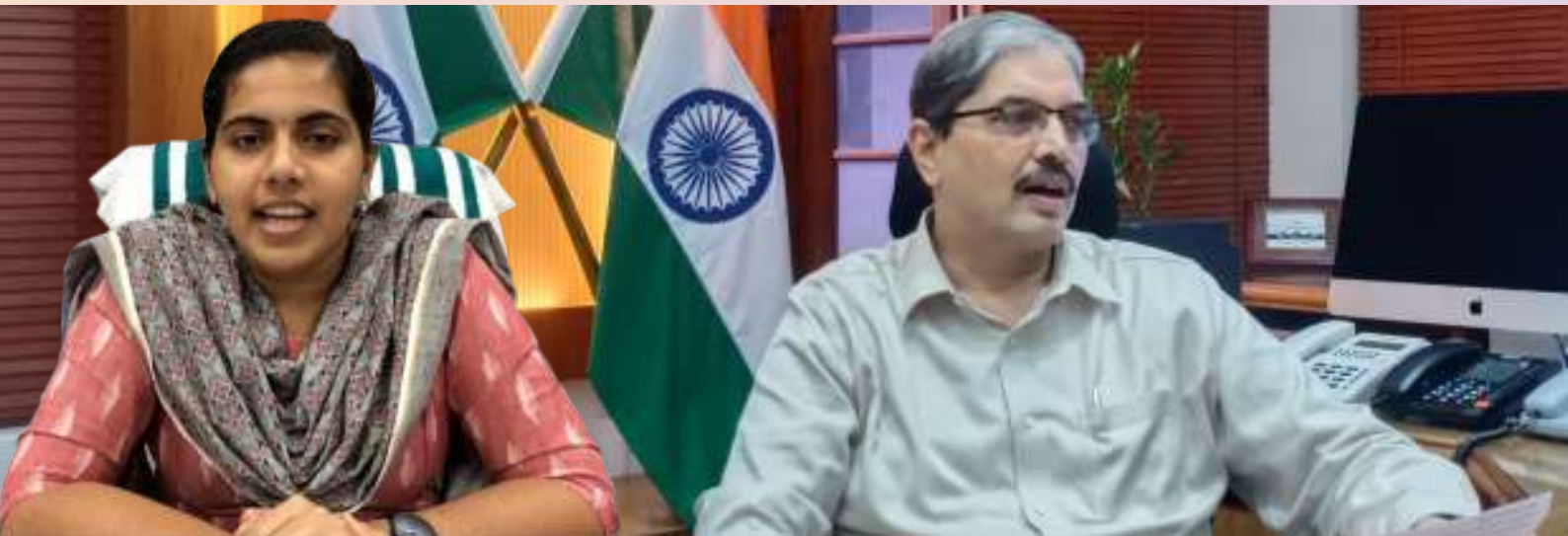
Chief Guest: Honourable Mayor of Trivandrum Corporation, Miss Arya Rajendran